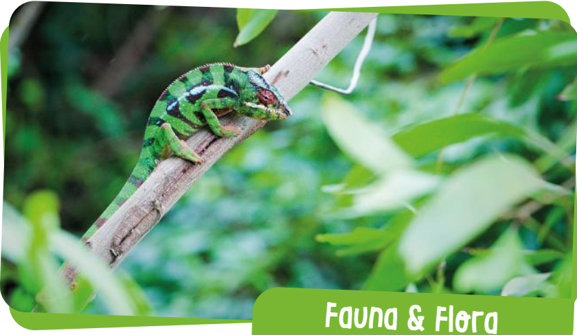
Fauna & Flora

Madagascar's natural heritage is incredibly rich. This island continent is the 4th largest in the world. 80% of its wildlife and plant life is endemic, who can say more? For over 30 years, the national parks and protected areas have been working to preserve, study and hand down this heritage, a real treasure for humanity. Its beauties are so bountiful that a lifetime would not be enough to encompass them all.